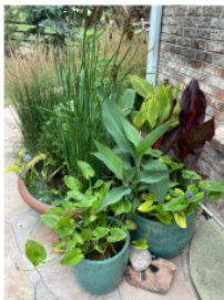
Example of a Water Container Garden