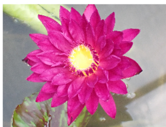
Tropical Lily Bull's Eye

We hope to see you at the CWGS Annual Plant Sale!