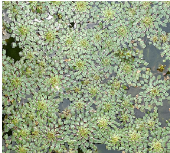
Mosaic Plant