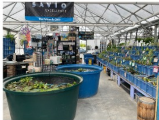
Pond Professionals, Northglenn

Next to Dreamscapes Landscape Materials. Pull into Dreamscapes' lot and go around their building. See you there!