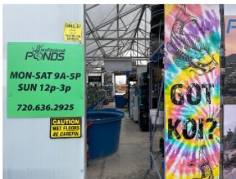
Pond Professionals, Northglenn