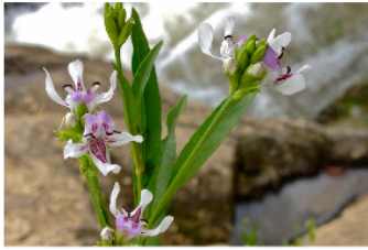
Water Willow