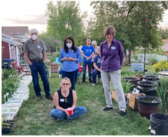
Participants at 2022 Plant Swap