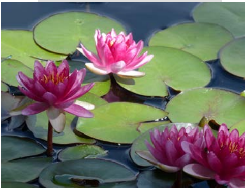
Water Lilies at DBG during the 2015 Water Blossom Festival, (photo courtesy of Bill Powell)

A tour of the Four Towers Pool containing the International Waterlily and Water Gardening Society's New Water Lily competition lilies for 2015 was given by Tamara Kilbane, Senior Horticulturist of the Aquatic Collection at Denver Botanic Gardens.