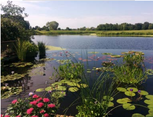
Powell Gardens, 2015 IWGS Symposium

In August, I had the pleasure of attending the International Waterlily and Water Gardening Society's Annual Symposium. This yearly event is held in a different place every year. Last year, Denver hosted the Symposium. The host this year was Water's Edge in Lawrence, Kansas. There was good attendance, 84 people registered from 6 countries. Many people in the industry were represented; including people with retail stores, landscaping businesses, maintenance businesses, pond supply businesses, and plant wholesalers. There were also many hobbyists, especially ones from local clubs.