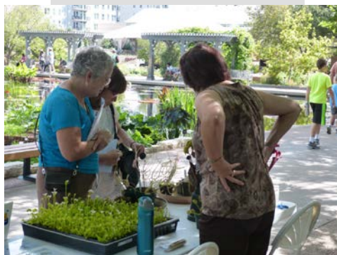
2015 Water Blossom Festival at DBG, (photo courtesy of Bill Powell)

Member at Large (2), Member at Large (4), Member at Large (6), and Member at Large (8)