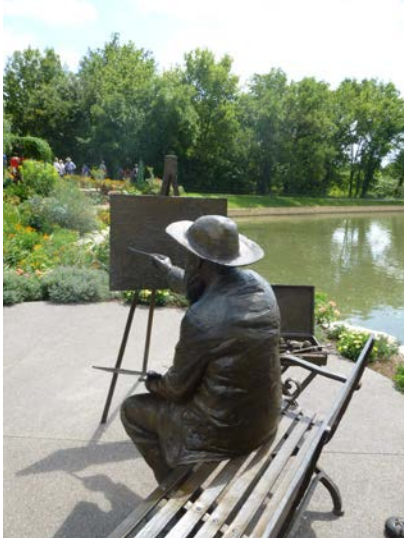
Overland Park, 2015 IWGS Symposium, (photo courtesy of Vicki Aber)

The first day, we had a tour of various Kansas City fountains - there are quite a few (Kansas City is also known as the city of fountains). From there, we went to an orchid retailer (Bird's Botanicals) that is located in a cave. I know orchids aren't typical water garden plants, but most of us don't restrict ourselves to just water gardens. It was very interesting to think of a plant business in a cave, since temperature and humidity are controlled, they just have to add light. The next stop was a small garden with a few water features (Ewing and Muriel Kauffman Memorial Garden). It was small, but very well done. From there, we went to Overland Park, had a boxed lunch, and enjoyed wandering the gardens before we were given a guided tour of the water features. They had many displays based on Monet's paintings, the colors he used, and the type of flowers (not just lilies) he painted. They even had a bronze statue of Monet painting by the pond. From there, we went back to the hotel to get some rest for the next day.