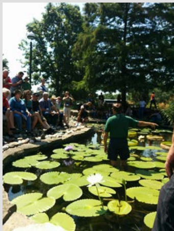
2015 IWGS Symposium