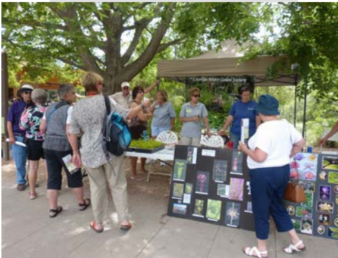
2015 Water Blossom Festival at DBG