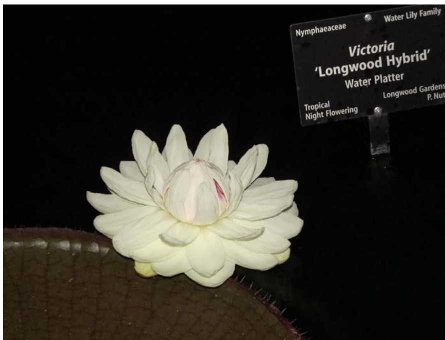
Victoria 'Longwood Hybrid', Monet Pond at Denver Botanic Gardens

Online at: www.colowatergardensociety.org