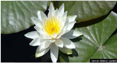
'Bea Taplin' Hardy Water Lily, (Photo courtesy of Denver Botanic Gardens)