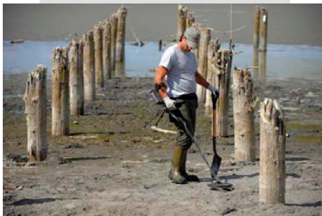
Old Pier at Berkeley Lake Park, (Photo courtesy of The Denver Post)