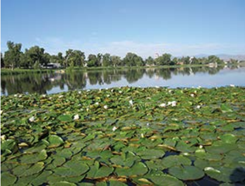
Berkeley Lake with 'Bea Taplin' Lilies