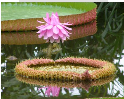
'Victoria amazonica' Water Lily, (photo courtesy of http://commons.wikimedia.org/ )