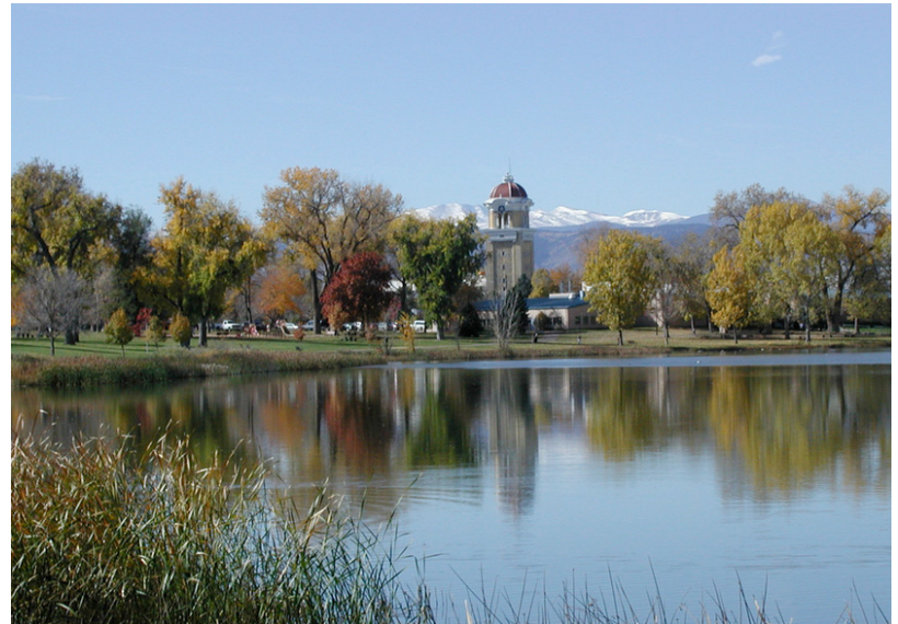
Berkely Lake Park, Denver, CO, (photo courtesy of http://www.city-data.com )

Online at: www.colowatergardensociety.org