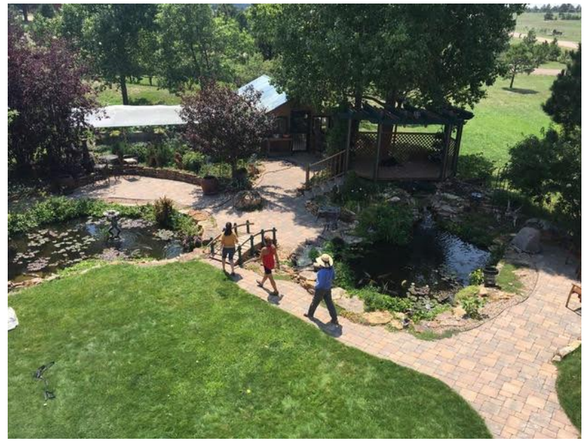
Water's Edge in Elbert, CO, (photo courtesy of Water's Edge)

Journal of the Colorado Water Garden Society