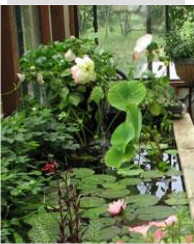
Greenhouse at Water's Edge, Elbert, CO, (photo courtesy of Water's Edge)