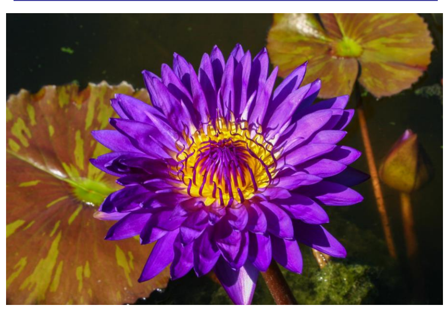
Tropical water lily 'Tanzanite' , (photo courtesy of Florida Aquatic Nurseries)

Online at: www.colowatergardensociety.org