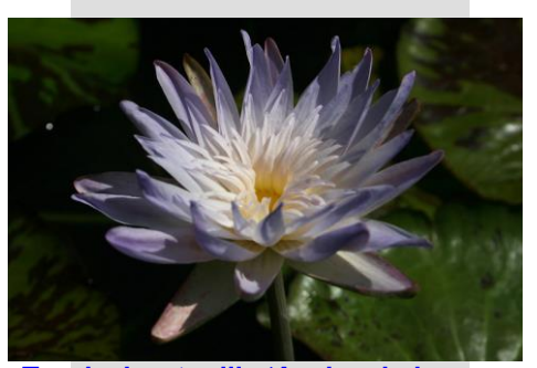
Tropical water lily 'Avalanche', (photo courtesy of International Water Lily Collection)