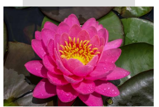
Hardy water lily 'Perry's Fire Opal', (photo courtesy of Florida Aquatic Nurseries)