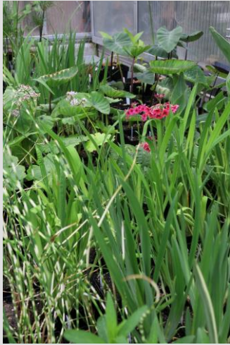
Plants that will be available for sale online at the Denver Botanic Gardens' Spring Plant Sale, (photo courtesy of Tamara Kilbane)