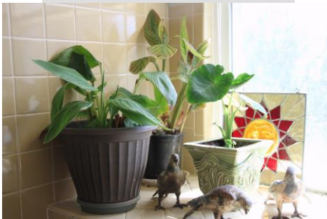
Two Canna pots were overwintered in a south facing bathroom and will be brought back out to the pond in early June. The ceramic pot on the right has a taro tuber from an Asian market I started growing at the end of February, (photo courtesy of Jim Arneill)