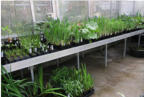
Plants that will be available for sale online at the Denver Botanic Gardens' Spring Plant Sale, (photo courtesy of Tamara Kilbane)