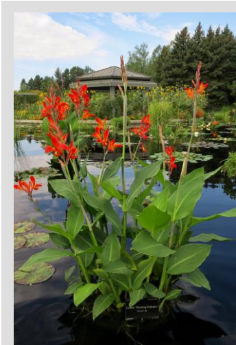
The bright red colors of Canna 'Flaming Kabobs' add a splash of color to the Monet Pool with the Gazebo in the background at Denver Botanic Gardens, (photo courtesy of Tamara Kilbane)