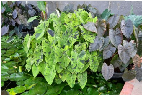
The chartreuse and darker green colored leaves of Colocasia 'Mojito' add a striking touch to a water feature, (photo courtesy of Tamara Kilbane)