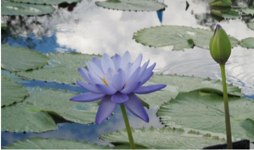
Australian Water Lily Hybrid at the International Waterlily Collection