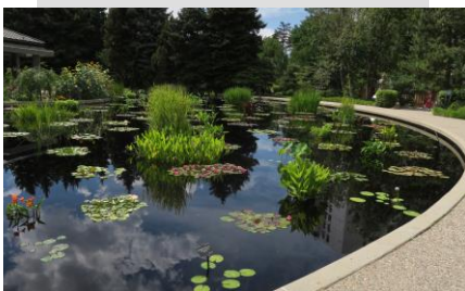
Monet Pool at Denver Botanic Gardens on July 16 th , (photo courtesy of Tamara Kilbane)