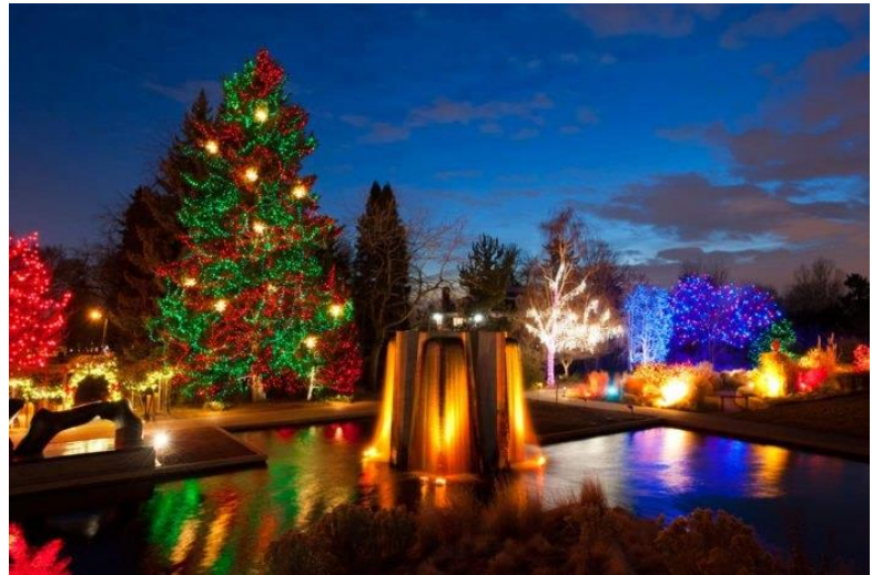
Blossoms of Light at Denver Botanic Gardens, (photo courtesy of Denver Botanic Gardens)

Online at: www.colowatergardensociety.org