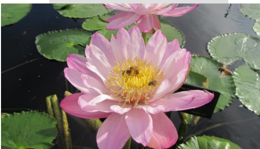
Australian Water Lily Hybrid at the International Waterlily Collection, (photo courtesy of Dorothy Martinez)