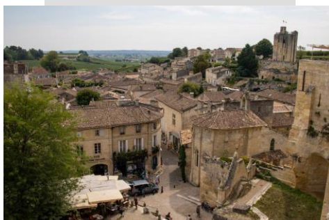
Saint-Émilion