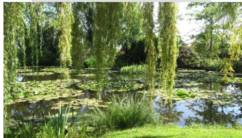
Monet's Water Garden in Giverny, (photo courtesy of Dorothy Martinez)

The next morning, it was hit the ground running. Our tour bus left the hotel at 8:30 am sharp. We worked our way through traffic and arrived at the Musée de l'Orangerie to view Claude Monet's impressive water lily murals installed onto the walls of two large oval rooms bathed in natural light from skylights.