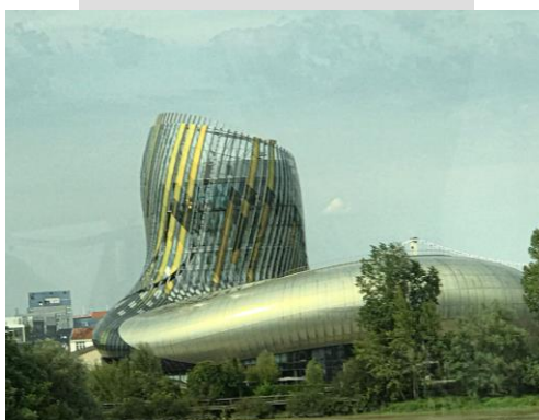
La Cité du Vin in Bordeaux