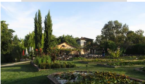
Latour-Marliac Museum & the Villa D'Edgard in Temple-sur-Lot, (photo courtesy of Dorothy Martinez)

After an hour and a half at the Museum, we boarded the bus and headed for Giverny, where Monet's home and gardens are located. After a lecture by Caroline Holmes on Monet and Impressionist Gardens, we were treated to a delightful lunch at Restaurant Les Nymphéas. After lunch there was a guided tour of the gardens with Nicolas Obert, the gardener responsible for the pond. We then had 2 hours to explore the Musée des Impressionnismes, the village of Giverny, and Monet's home and gardens on our own. At 7:00 pm, we met at La Capucine, a concept garden shop/boutique/restaurant, located within Giverny. There we had another wonderful meal where we mingled and socialized. We returned to our hotel about 10:00 pm.