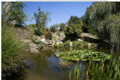
Les Jardins d'Eau (The Water Gardens) in Carsac-Aillac