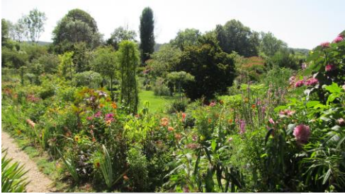
Monet's Garden in Giverny

WOW, what an experience! I am really glad I made the decision to attend the 2019 IWGS Symposium in France August 21 st – August 26 th .