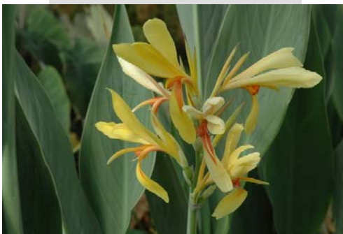
Canna 'Paton', (photo courtesy of Oregon Aquatic Nurseries)