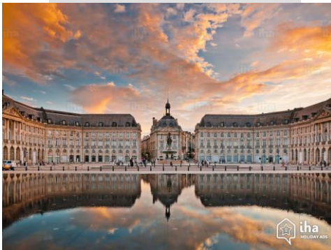
Bordeaux , (photo courtesy of iha.fr)