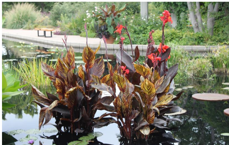
Besides adding color with their beautiful flowers, cannas also often have attractive foliage, (photo courtesy of Jim Arneill)

Online at: www.colowatergardensociety.org