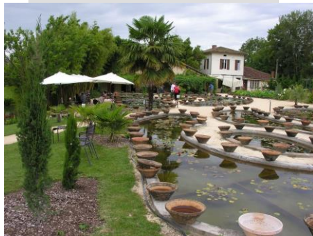
Latour-Marliac , (photo courtesy of matinlumineaux.blogspot.com)