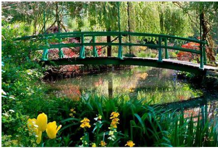
Monet's Water Garden in Giverny , (photo courtesy of Paris Shuttle Transfer)