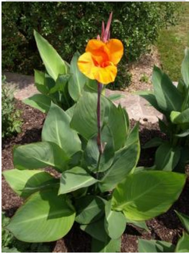
Canna 'Emerald Sunset'