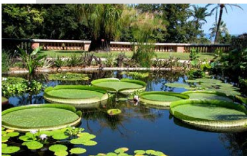
Jardin Botanique Exotique Val-Rahmeh, Menton, France

Claude Monet lived and worked for many years in the small village of Giverny (500 souls currently live there), 75 km (45 miles) north west of Paris. As a consequence, diving into Monet's legacy naturally brings most people to "Ile-de-France", the busy region surrounding Paris, France. This is precisely where the 2019 IWGS Symposium hosting team, led by members of the IWGS European chapter, the European Waterlily and Lotus Association (EWLA), propose to start our annual gathering.