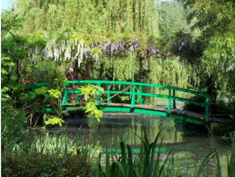
Claude Monet Bridge, Giverny, France