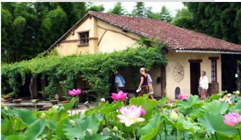
Latour-Marliac, Le Temple-sur-Lot, France , (photo courtesy of www.latour-marliac.com )

As some of you may know, the host country has been selected a while ago already, and it will be France! When one considers France from a water gardening perspective, many things may come to mind, but I'm pretty sure Claude Monet's "Nymphéas" is pretty close to the top of the list. The world-famous paintings (actually approximately 250 of them) are one the historical landmarks when it comes to popularization of water plants and how amazingly the simplest water feature can change any garden or terrace.