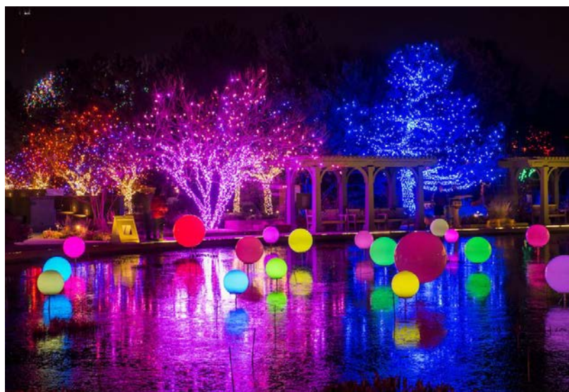
Blossoms of Light at Denver Botanic Gardens, (photo courtesy of Denver Botanic Gardens)

Online at: www.colowatergardensociety.org