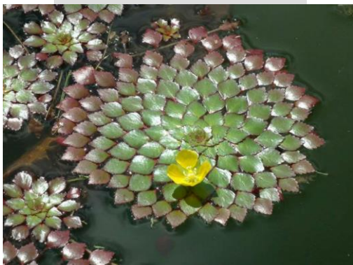
Mosaic Plant, Ludwigia sedioides, (photo courtesy of worldoffloweringplants.com )

Again, we want to extend our sincerest thanks to everyone!