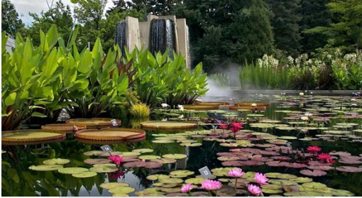
Four Towers Pond, Denver Botanic Gardens, (photo courtesy of Denver Botanic Gardens)

There will be a great selection of carnivorous plants from the aquatic plants' greenhouse to view including Sundews, Pitcher Plants, and Venus Fly Traps. We also hope to have a Mosaic Plant to view as well.