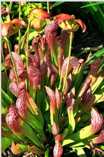
Pitcher Plant, Sarracenia 'Scarlet Belle'