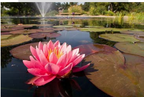
Monet Pond, Denver Botanic Gardens, (photo courtesy of Denver Botanic Gardens)

Please join us August 4 th from 9:00 am to 1:00 pm at the Denver Botanic Gardens Monet Pond area for the annual Water Blossom Celebration! Visitors every year enjoy tours of the beautiful ponds and the beauty of some of our favorite flowers. This is an opportunity to share your knowledge of water plants as well as ask any questions you may have. We all learn from one another!!