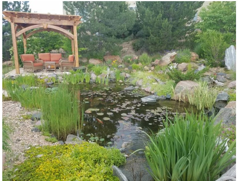
Bill & Janet Bathurst's Pond, Arvada, (photo courtesy of Bill Bathurst)