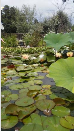
Dan & Vicki Aber's Pond, Arvada, (photo courtesy of Vicki Aber)