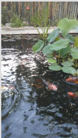
Dan & Vicki Aber's Pond, Arvada, (photo courtesy of Vicki Aber)