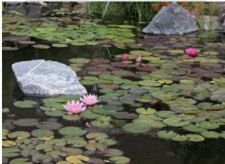
Bill & Janet Bathurst's Pond, Arvada, (photo courtesy of Bill Bathurst)