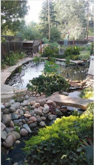
Dan & Vicki Aber's Pond, Arvada, (photo courtesy of Vicki Aber)