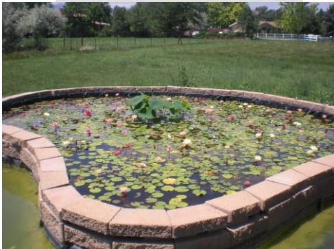
Lou Hayward's Pond, Golden, (photo courtesy of Lou Hayward)