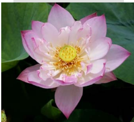
'Jade Tower with Drunkard' Lotus

We will gather around the plants and everyone will say what they brought and a little about them. If they bloom, what color they are. If you know the variety, that is helpful. If there are special requirements for the plant, let us know. Once everyone has shared the information about his or her plants, the fun begins. Hopefully, as people are telling about their plants, you are getting an idea of what you would like to bring home. For every item you bring, you may pick one item from someone else's offerings. It is on the honor system. Once everyone has gotten what they are entitled to, we will open it up for people that didn't bring anything or only brought a couple things, but would like to take home more.