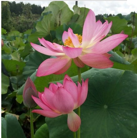
'Meizhong Hong' Lotus, (photo courtesy of Ten Mile Creek Nursery)