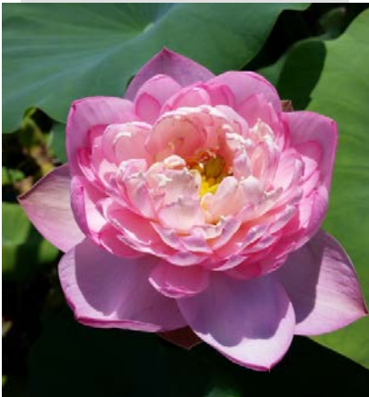
'Moonbeam' Lotus, (photo courtesy of Ten Mile Creek Nursery)