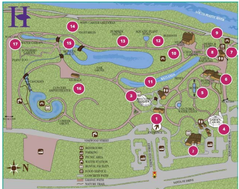
Map of Hudson Gardens – Business Office Location is #6, (photo courtesy of The Hudson Gardens and Event Center)