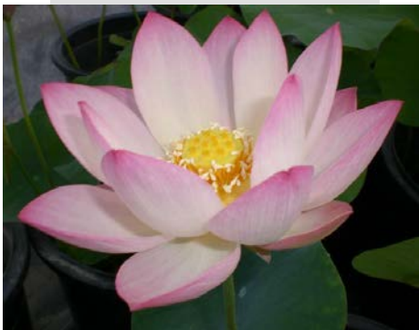
'Decorated Lantern' Lotus, (photo courtesy of Ten Mile Creek Nursery)