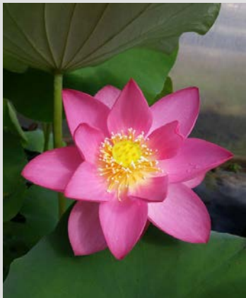
'Red at Sunset' Lotus, (photo courtesy of Ten Mile Creek Nursery)