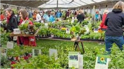
Denver Botanic Gardens Plant Sale

As I write this article, the temperature outside is 13 degrees and a light snow is falling. So thinking about the Denver Botanic Gardens Spring Plant Sale warms my thoughts. Every year the Aquatics Division needs our club member's water plant expertise to help the public make good plant choices. So, if you like talking about water plants and helping people, this may be the job for you!