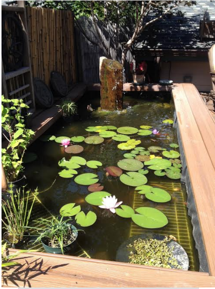
Carri Currier's Pond