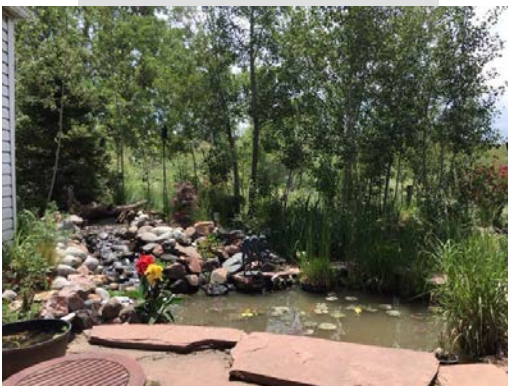
Tymkovich Pond, (photo courtesy of Terri Tymkovich)