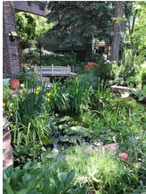
Charlotte & John Knudson's Pond in North Boulder, (photo courtesy of Charlotte Knudson)

Online at: www.colowatergardensociety.org