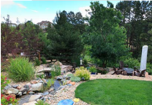
Tom Gebhart's Pond