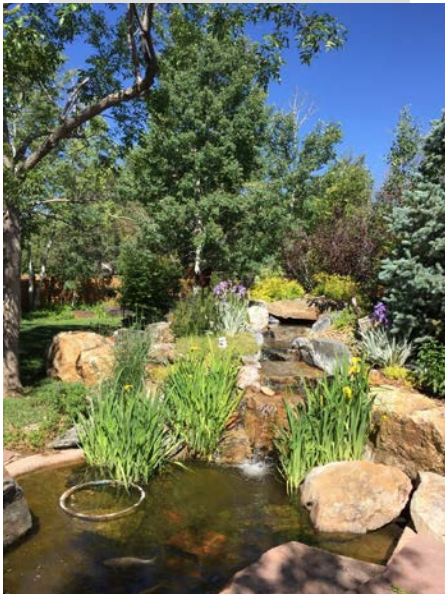
Bob & Jill Cartmell's Pond , (photo courtesy of Bob Cartmell)