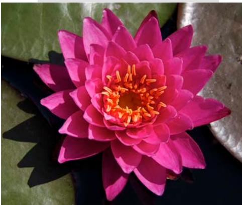
IWGS 2 nd Place Tie People's Choice Hardy Water Lily 'Kotchanat' , (photo courtesy of Tamara Kilbane)

Everyone always has a great time and the White Elephant Gift Exchange is very popular as well. Please bring a guest and kick off the holiday season in style and plan on attending the Holiday Banquet!