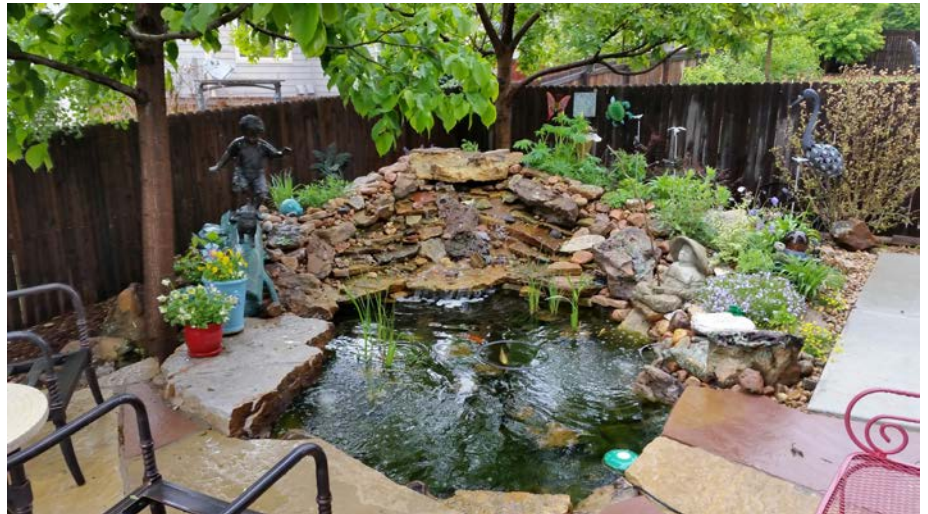
Pond Preview of 2015 Pond Tour, (photo courtesy of Dennis Weatherman)

Online at: www.colowatergardensociety.org