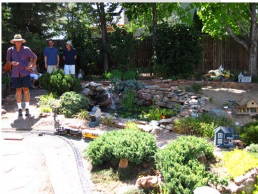
Pond Preview of 2015 Pond Tour