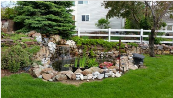
Pond Preview of 2015 Pond Tour, (photo courtesy of Dennis Weatherman)