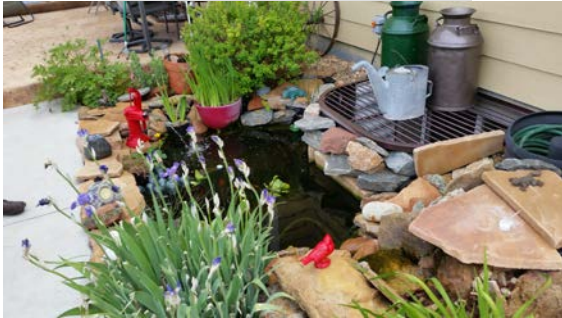
Pond Preview of 2015 Pond Tour, (photo courtesy of Dennis Weatherman)