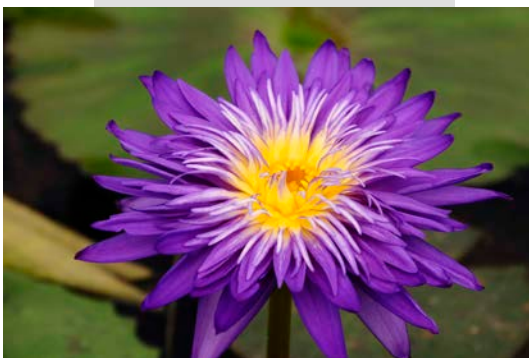
Tropical Water Lily 'Bob Hoffman'