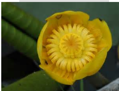
Nuphar lutea also known as Spatterdock , (photo courtesy of http://tcf.bh.cornell.edu/imgs/jdelaet/r/Nymphaeaceae_Nuphar_lutea_30334.html )

For more information, please contact Brenda or Peter at (303) 278-2106 or moose.4bph@q.com.