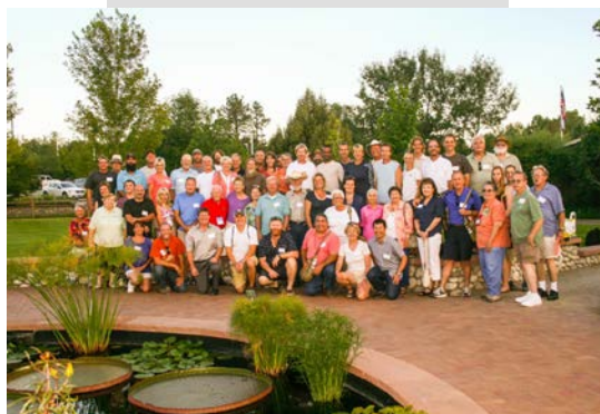
2014 IWGS Symposium Attendees at Hudson Gardens , (photo courtesy of IWGS Facebook page)

The weather was hot and the sun intense, but all of the attendees seemed to enjoy touring the gardens and many were overheard planning to come back to spend more time exploring on their own (two attendees from St. Louis made a special trip back the following evening to see a Victoria cruziana bloom open).