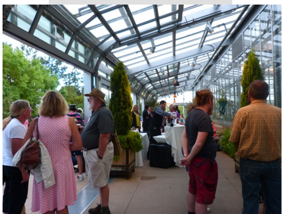
2014 IWGS Symposium Cocktails at the Orangerie at Denver Botanic Gardens , (photo courtesy of Bill Powell)