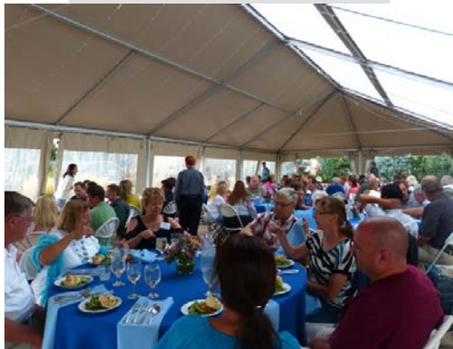
2014 IWGS Symposium Dinner at the West Terrace at Denver Botanic Gardens