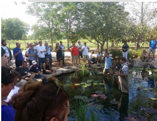
2014 IWGS Symposium Hybridizer Demonstration at Hudson Gardens

Overall, the Symposium was very well received by attendees. Thank you to all who helped to make the event such a success!