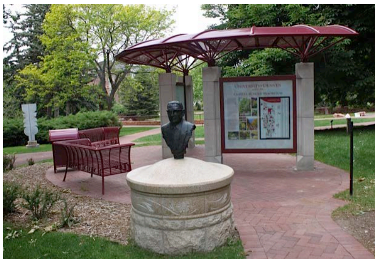
Chester M. Alter Pavilion at University of Denver

Online at: www.colowatergardensociety.org