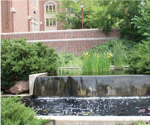
Water Feature at University of Denver, (photo courtesy Jim Arneill)