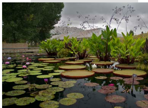
2013 IWGS Competition Pond at DBG with Victoria Water Lilies, (photo courtesy of Tamara Kilbane)