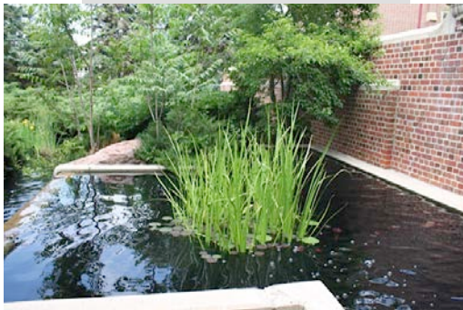
Water Feature at University of Denver, (photo courtesy of Jim Arneill)

Please bring your own picnic lunch, CWGS will provide drinks and dessert. After the picnic, we will have the opportunity to walk around with Mark and view a variety of water lilies, lotuses, and many marginal plants in the different pools there. Since these water plants will be in the early stages of the season, you may want to return in July or August to see them at their peak. The arboretum displays an interesting collection of well-labeled, stately trees, including 10 State Champions.