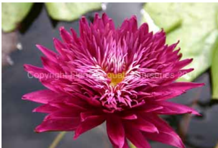
Scarlet Flame Tropical Lily, (photo courtesy of Florida Aquatic Nurseries)

Online at: www.colowatergardensociety.org