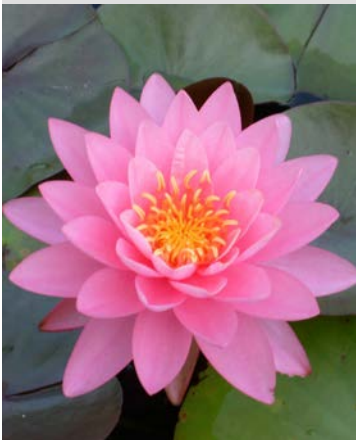
Fire Opal Hardy Lily