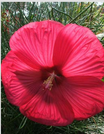
Water Hibiscus, Dwarf Red , (photo courtesy of WaterScapes Aquatic Nursery)