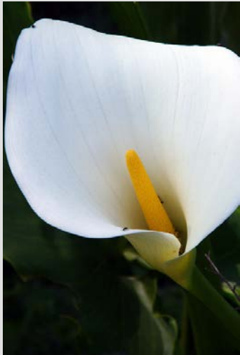
Calla Lily , (photo courtesy of WaterScapes Aquatic Plant Nursery)