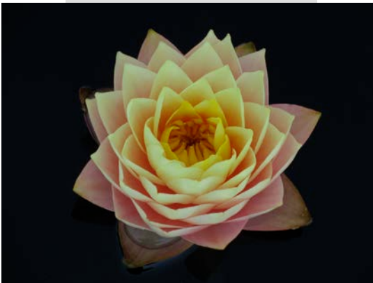
2013 IWGS Competition Lily, Denver Botanic Gardens