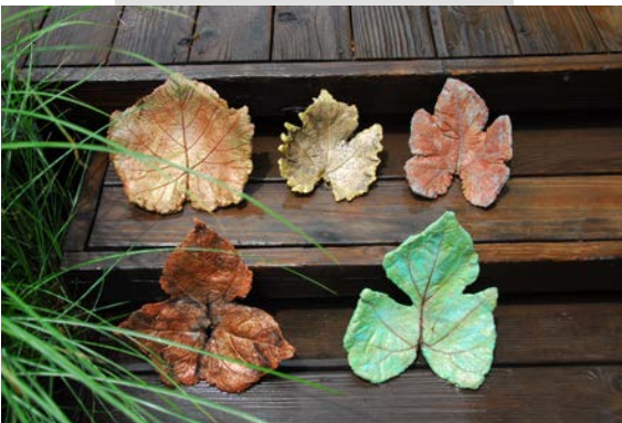
Examples of Leaf Casts by Theresa Rounds

Payment will need to be received prior to the first class in order for you to participate.