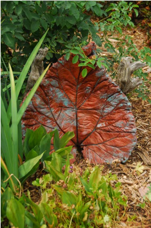
Example of a Leaf Cast by Theresa Rounds, (Photo courtesy of Theresa Rounds)

The first class, to be held on Saturday, August 17 th from 1:00 pm to 5:00 pm, will be when we make a cast of an actual leaf. The second class, to be held on Saturday, August 24 th from 1:00 to 5:00 pm, will be when the casts are revealed by peeling the leaf back and cleaning the concrete cast. The group can decide if they want to gather for a third session to paint the leaves together.