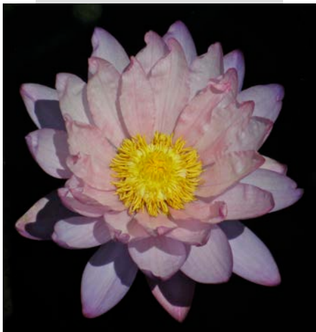
2013 IWGS Competition Water Lily, Denver Botanic Gardens, (Photo courtesy of Tamara Kilbane)