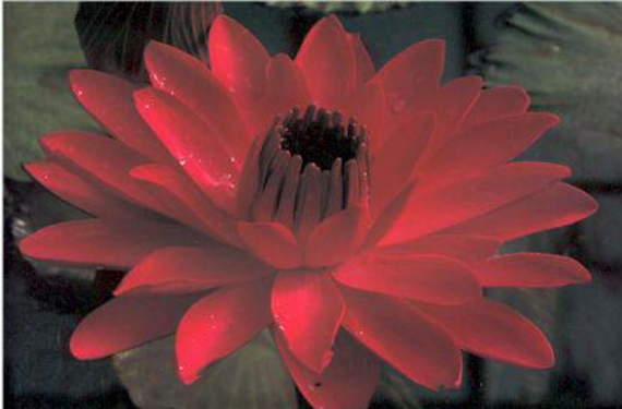
Antares Tropical Water Lily , (Photo courtesy of www.pondbiz.com )