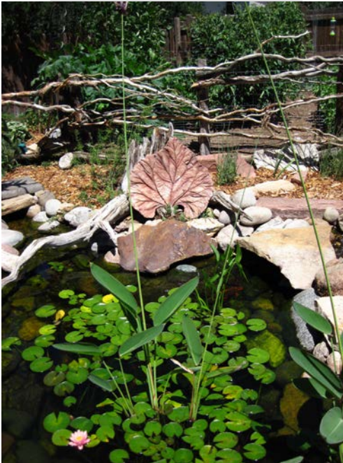
Dave & Theresa Rounds' Pond – 2012 Pond Tour, (Photo courtesy of John Funk)