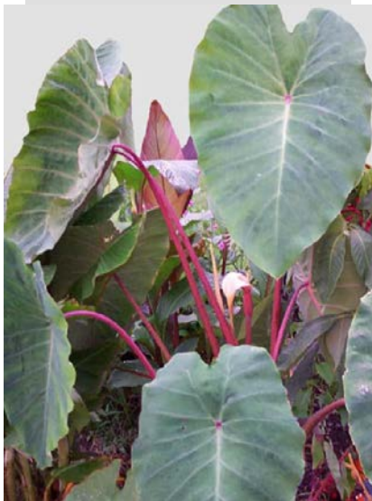
'Pink China' Taro , (Photo courtesy of Jeff Crawford, www.photobucket.com )