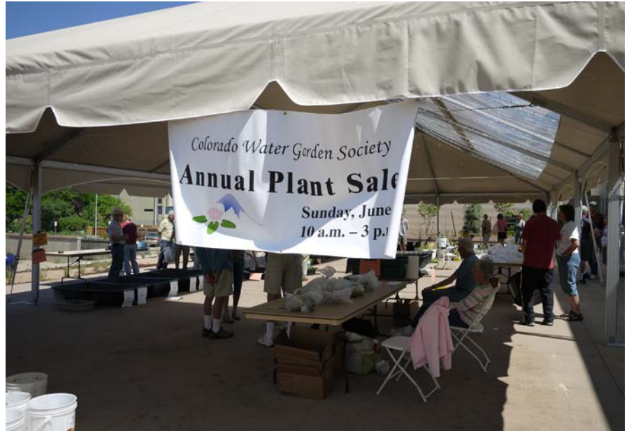
CWGS Plant Sale at Denver Botanic Gardens, (photo courtesy of Bill Powell)

Online at: www.colowatergardensociety.org