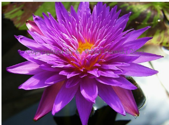
Bimini Twist Tropical Lily , (Photo courtesy of Victor Plawski, www.waterplants.com )

To access the West Terrace, from York Street, turn right into the DBG staff/delivery entrance before you get to the Gardens proper. This is the first driveway after crossing 11 th Avenue. There is a gated entrance, but the gate will be open. You will see a parking area after the gate, drive past this parking area. Follow the jogs in the drive and continue all the way back along the side of the buildings. Park anywhere in the spaces beyond the greenhouse and storage area. The sale will be under the large tent on the West Terrace, just to the West of the greenhouses. The terrace is reached by stair or ramp from the building side of the parking area.