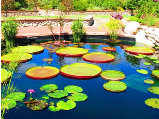
Hudson Gardens' Victoria Pond, August 1, 2012

Admission to Hudson Gardens is free this summer, so frequent visits are encouraged to see these exotic plants progress, as well as roses, perennials and eventually dahlias.