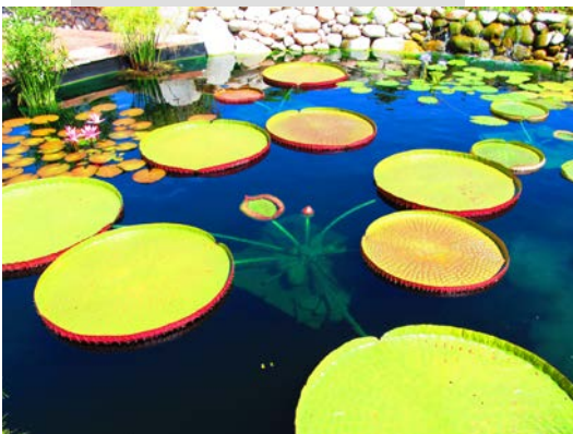
Hudson Gardens' Victoria Pond, August 1, 2012