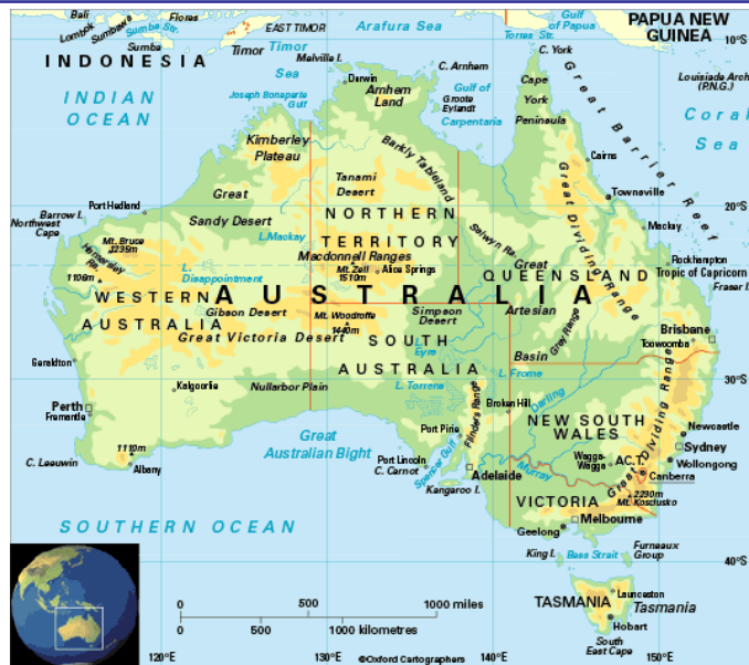
Map of Australia

Online at: www.colowatergardensociety.org