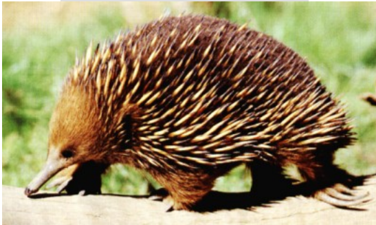
Echidna, (photo from www.neiu.edu/~mtaban/Mammals.html )