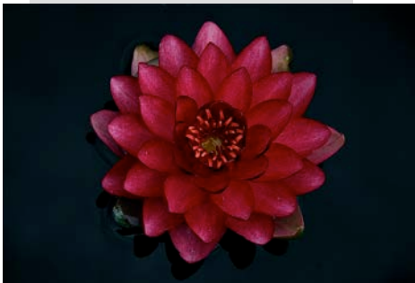
'Manee Red' – 2012 IWGS First Place Hardy Water Lily, Pairat Songpanich, Thailand, (Photo courtesy of Tamara Kilbane)