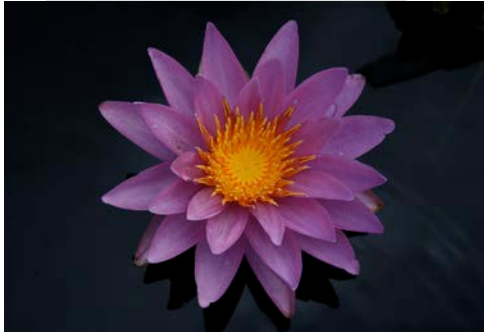
'Kiss the Sky' – 2012 IWGS First Place Intersubgeneric Water Lily & 2012 IWGS Second Best Overall Water Lily, Mike Giles, West Virginia