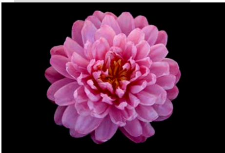
'Pink Pom Pom' – CWGS People's Choice First Place Hardy Water Lily & 2012 IWGS Second Place Hardy Water Lily, Tony Moore, Ohio, (Photo courtesy of Tamara Kilbane)