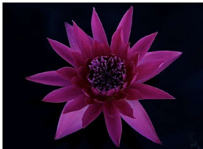
'Tropic Punch' - 2012 IWGS Best New Overall Water Lily and First Place Tropical Water Lily, Florida Aquatic Nurseries, (photo courtesy of Tamara Kilbane)

Online at: www.colowatergardensociety.org