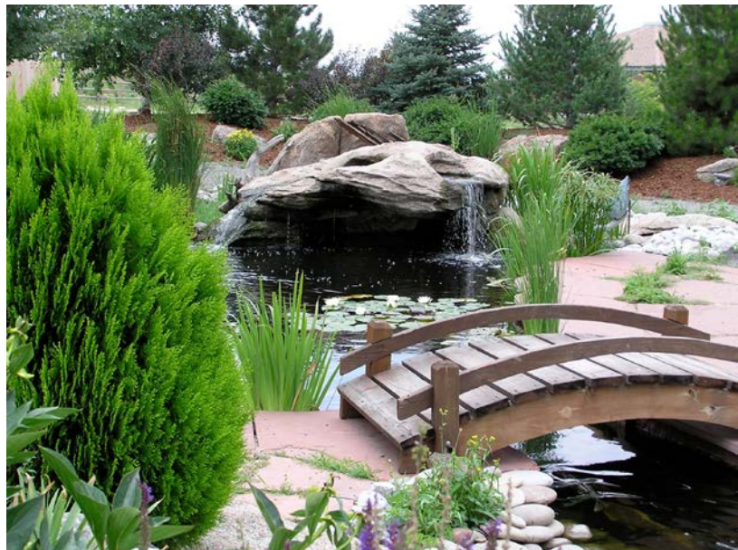
Pond at Mark Russo's, Site of the 2012 Picnic, (photo courtesy of Mark Russo)

Online at: www.colowatergardensociety.org