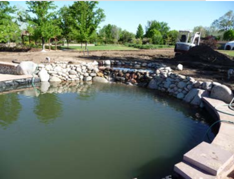
Victoria Pond Construction at Hudson Gardens, (photo courtesy of Bob Hoffman)