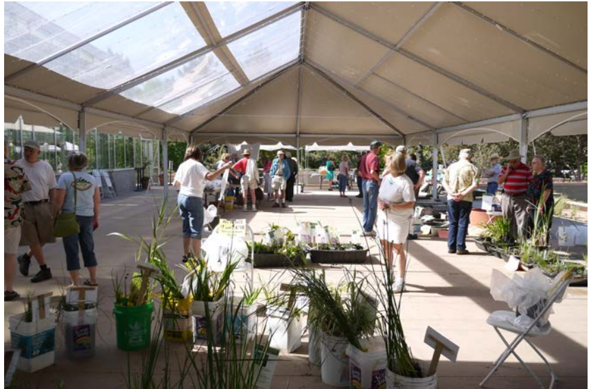
2011 CWGS Plant Sale at DBG's West Terrace

Online at: www.colowatergardensociety.org