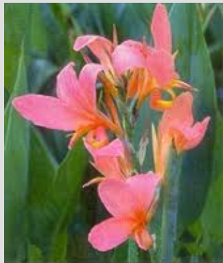
Canna Lily Erebus