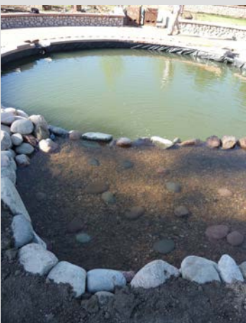
Victoria Pond Construction at Hudson Gardens