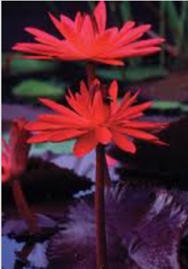
Red Flare Tropical Water Lily , (photo from www.froggyponds.com )