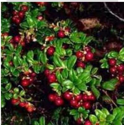
Cranberry Plant 'Stevens' , (photo from www.plainviewfarm.com )