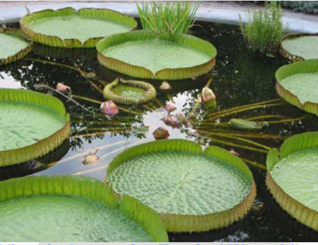
Victoria Amazonica Tropical Water Lily