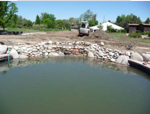
Victoria Pond Construction at Hudson Gardens, (photo courtesy of Bob Hoffman)