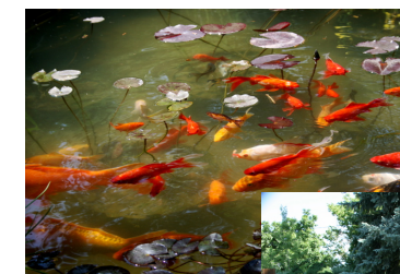
Above: Fish amid lilies at the Mayerchaks'

An avid water lily cultivator, Lois created the 6,000-gallon pond to showcase her water lilies. Koi and goldfish call the pond home. A unique bio-filter can be found behind the waterfall. It relies solely on lava rock and is pretty much maintenance free. Be sure and ask to be shown the tropical water lily habitat. Be prepared to be taken on a tour of Bob's "real" garden.