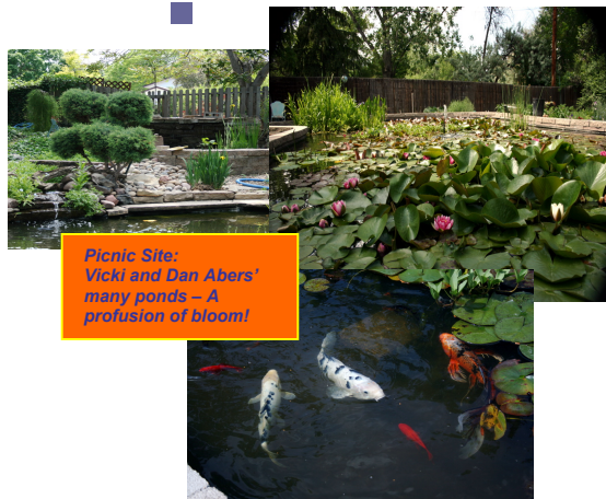
Picnic Site: Vicki and Dan Abers' many ponds – A profusion of bloom!

The back pond is also about 5,000 gallons and a lily haven. It was completed five years ago. Some large koi were adopted and they think it is a great place to raise the kids the kingfisher doesn't get. See how many you can count. Isn't this a wonderful spot for a picnic!