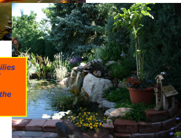
Right: Waterfall in the Elloes' backyard